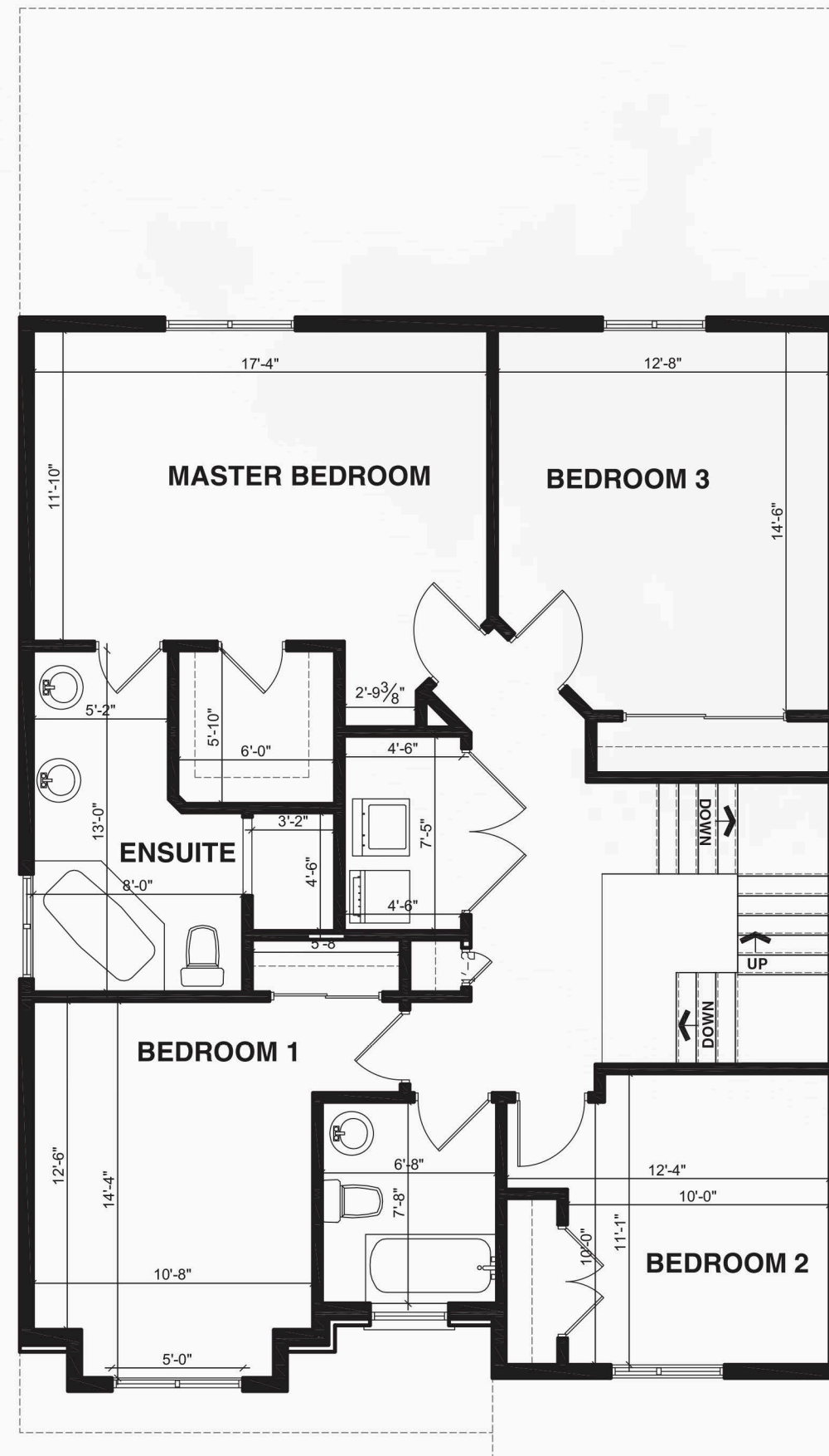
SECOND FLOOR 1285 sq.ft.